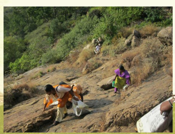
Arunachala Cleaning Project