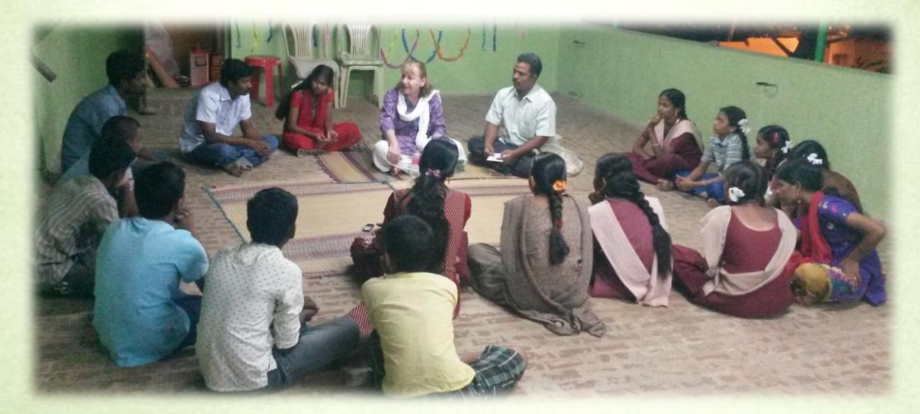
One of our meetings with the students!

planning for their marriage, we are counseling with the family and try to create a gap between studies and marriage, for the graduate students to get some work experience and save some money for their parent or for their marriage, so after completing the studies, they don't jump into the marriage life, husband, baby, family, responsibility, etc.,